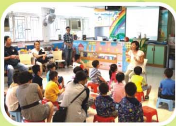
小一衔接班-普通话教中文课