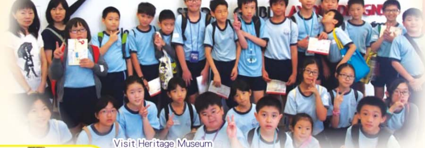
Visit Heritage Museum