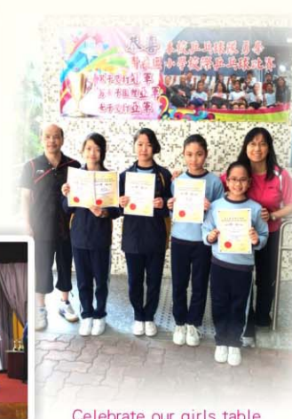
Celebrate our girls table tennis team got the reward