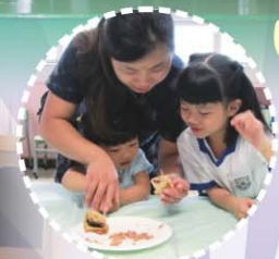
Parent-child making snack