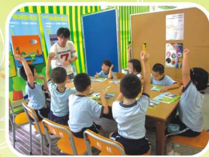
1 The Harmony Express