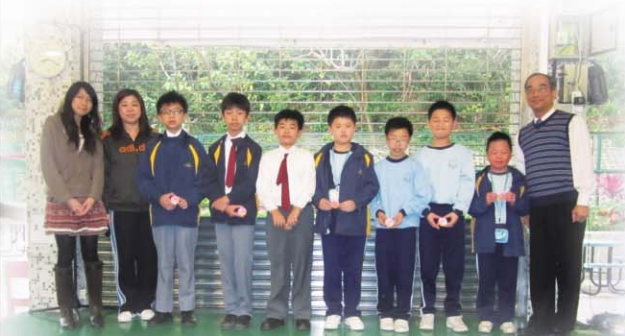
appointment of student teachers