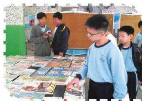
Floating Book Activity