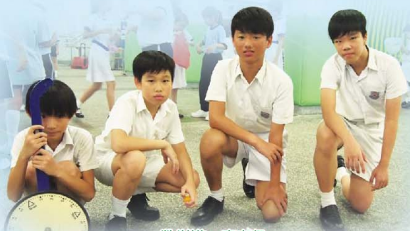
数学游 - 真有趣