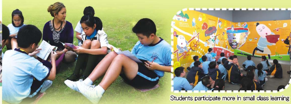
Students participate more in small class learning