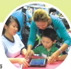
小一衔接班-外籍教师英语课

本校特别为有特殊需要的学生提供言语治疗、社交小组、抽离学习、功课及测考调适。教师还会定期与个别家长讨论协助子女成长的方案。