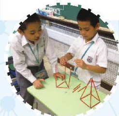
Making solid figure