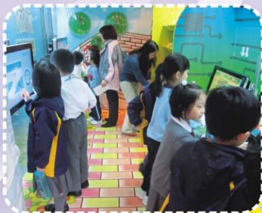
参观流动教育中心