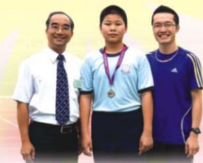
田径健儿为校争光