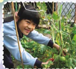
Tomato is ripe