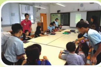
小一衔接班-数码追踪认识校园