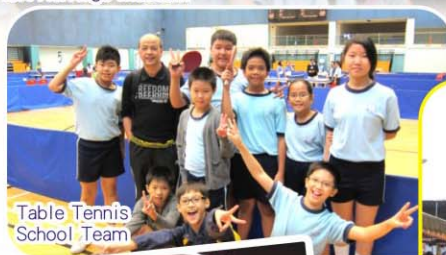
Table Tennis School Team