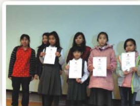
Got runner-up and merit in inter-school painting