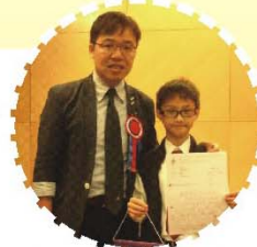
Our student won the champion in Chinese solo in Speech Festival