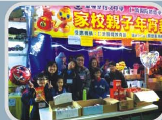
The parents and child bazaar on the eve of the Chinese New Year