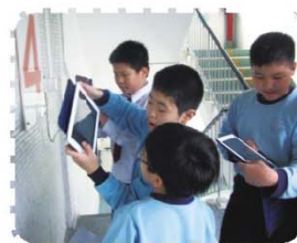
Use the i-Pad to do activity

Our students use their smartcards to register attendance and to pay for different fees.