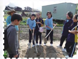
Planting organic vegetables and eating healthily