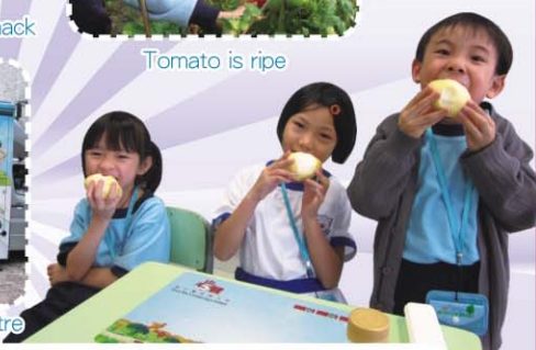
Fruit is delicious