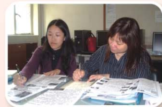
Teachers co-planned with HKCU partner