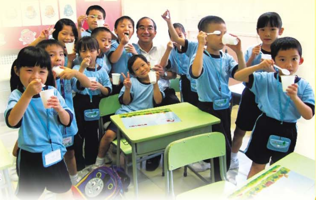
英文课内完成果冻与校长一同分享