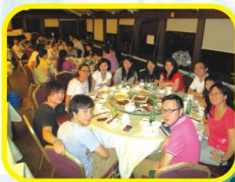
校友聚餐，師生濟濟一堂