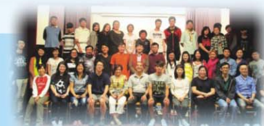
Annual meeting of the alumni association

Alumni Association of our school was established in 2010. Its aim is to build a network of our alumni as well as a platform for them to give contribution to the school.