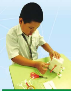
Making the car

We got the merit of "Hong Kong teachers ePlan Design Contest"