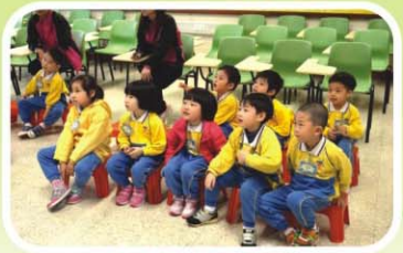
小一衔接班-音乐课