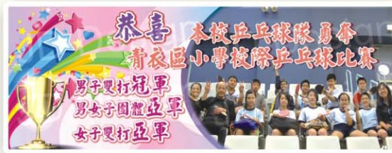
Table Tennis Banner