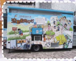
mobile health education centre