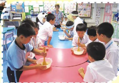
学好英语做麦片粥