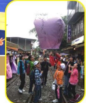
A Trip to Taiwan