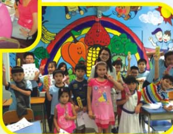
正向網絡家庭工作坊-兒童培訓部份