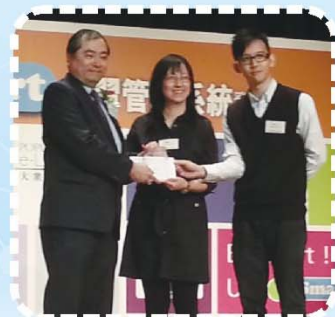
获得公开软件创作奖项