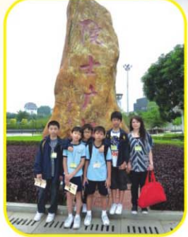
A Trip to Meizhou