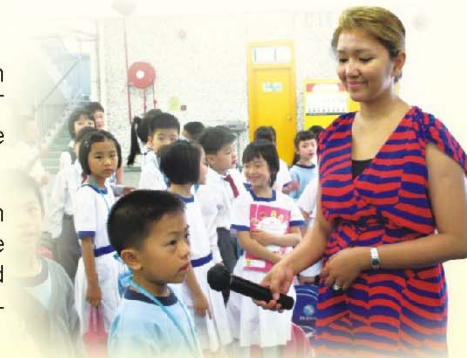
Singing English songs in the morning