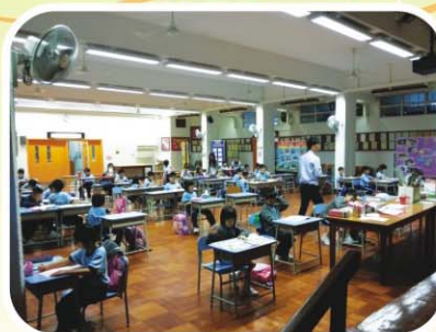
homework tutorial class for P.1-P.3