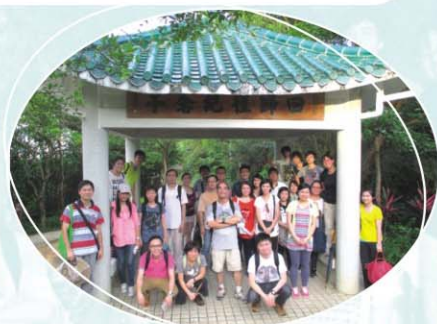
校友會登臨青衣回歸徑

仁济医院赵曾学韞小学校友会于2010年成立。校友会自成立后，曾多次举办会员大会、就职礼、盆菜宴及烧烤等活动，广结校友网络，期望能为母校的发展贡献自己的力量，回馈学校。