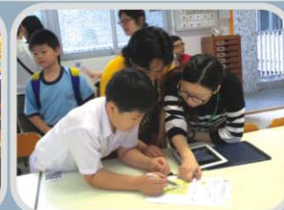
The activity of parents and child solving puzzles