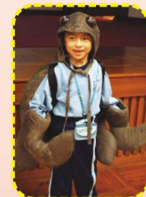
P.1 student acted as an extinct turtle in the WWF "Step" Programme