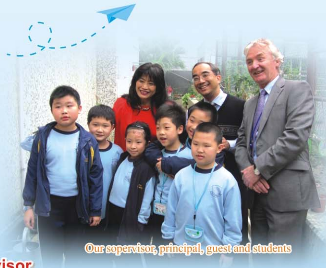
Our supervisor, principal, guest and students

We strive to make the school a happy learning place where everyone, with personal integrity, a positive attitude towards life and service to others always in mind, would be given the chance to follow one's own inclination.